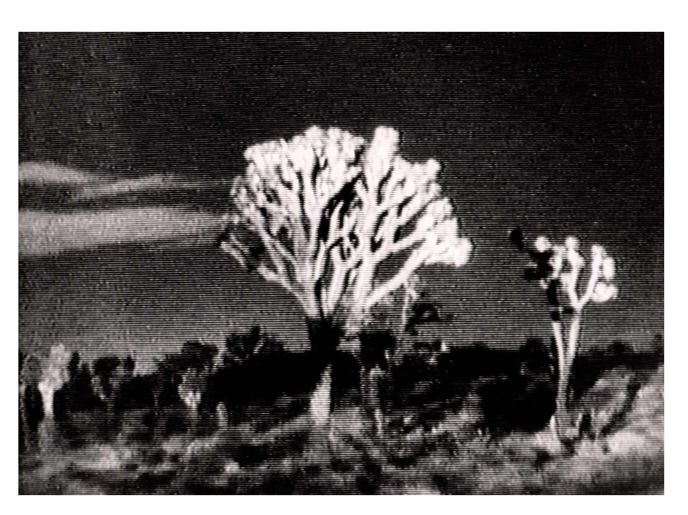
The Passing, 1991

Videotape, colour, mono sound; 28:00 minutes