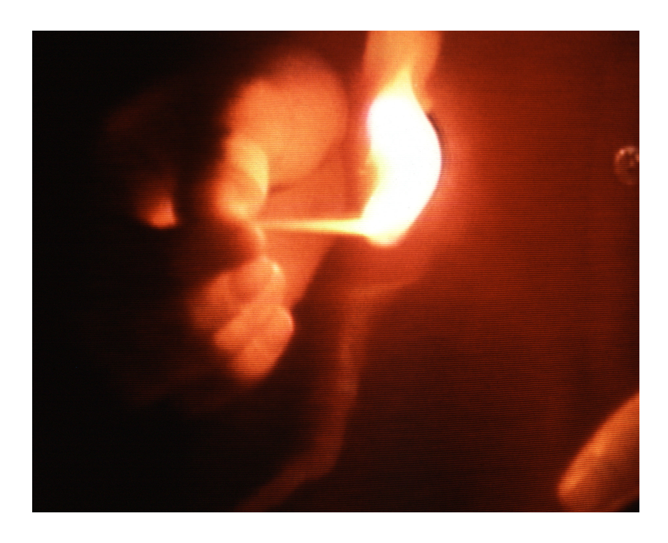
Hatsu-Yume (First Dream), 1981