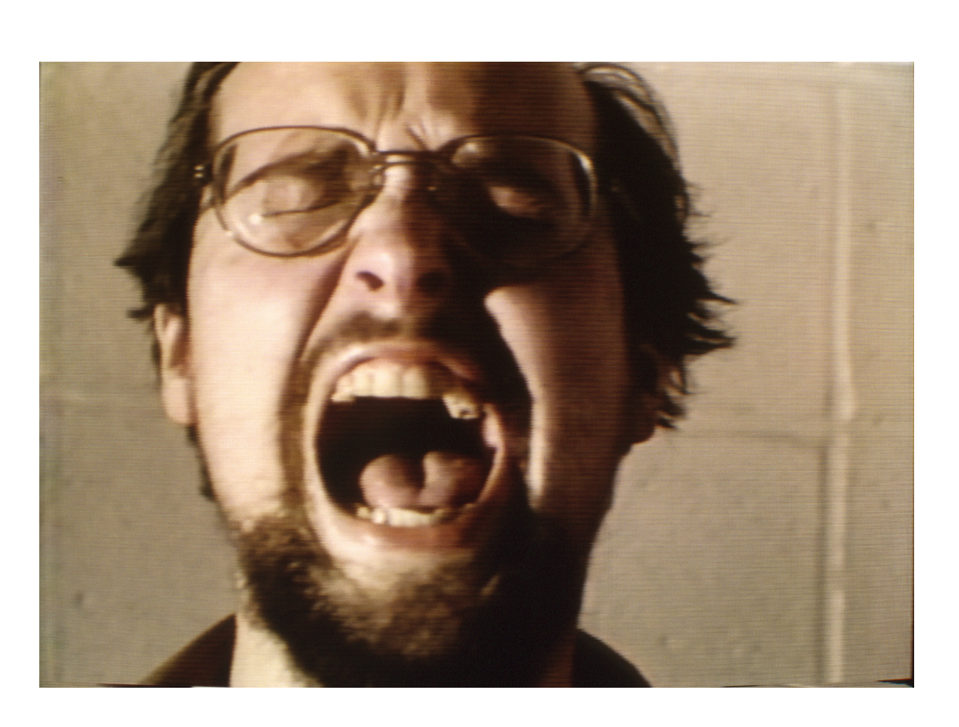
The Space Between the Teeth, 1976